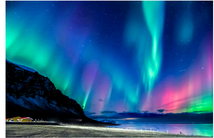
The Northern Lights

Year 1 – Why don't penguins need to fly?