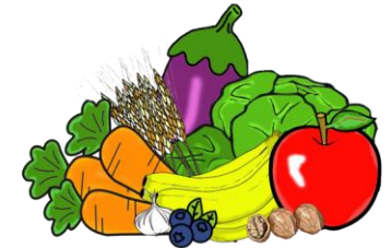
Fruit and Vegetables