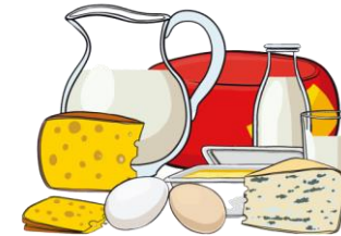
Milk and Dairy