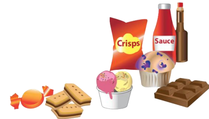
Food high in sugar and fat