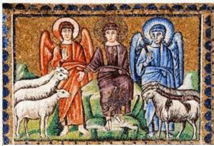
Parable of the sheep and the goats.