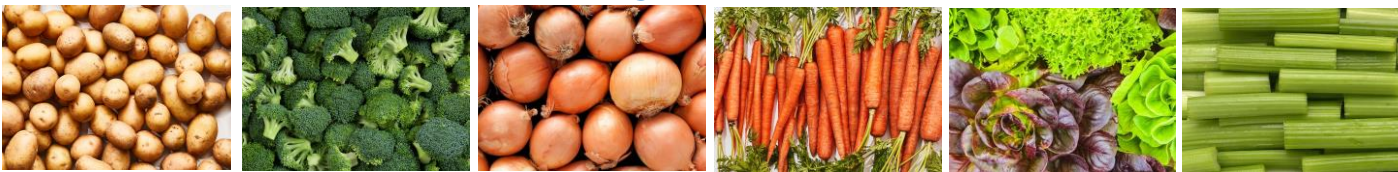
Potatoes Broccoli Onions Carrots Lettuce Celery