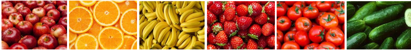
Apples Oranges Bananas Strawberries Tomatoes Cucumbers